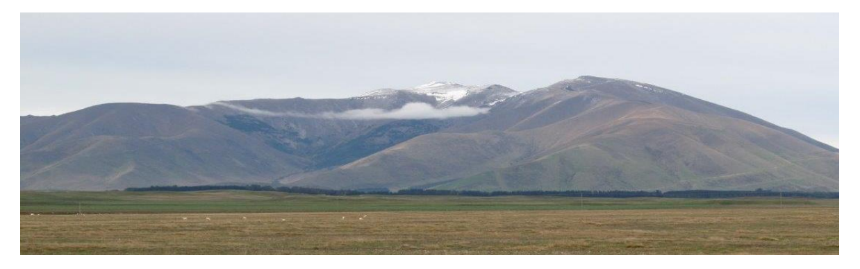
The higher altitude areas of the Diadem Range, as shown in the image, form the bulk of Ribbonwood Conservation Area