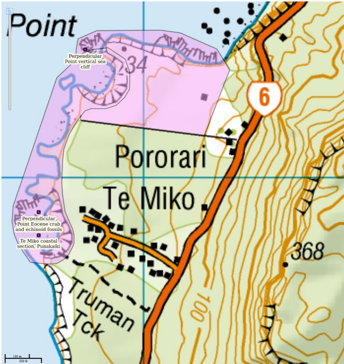
Geo-preservation Inventory identifying the geo-preservation area that includes part of Truman Track https://services.main.net.nz/geopreservation/