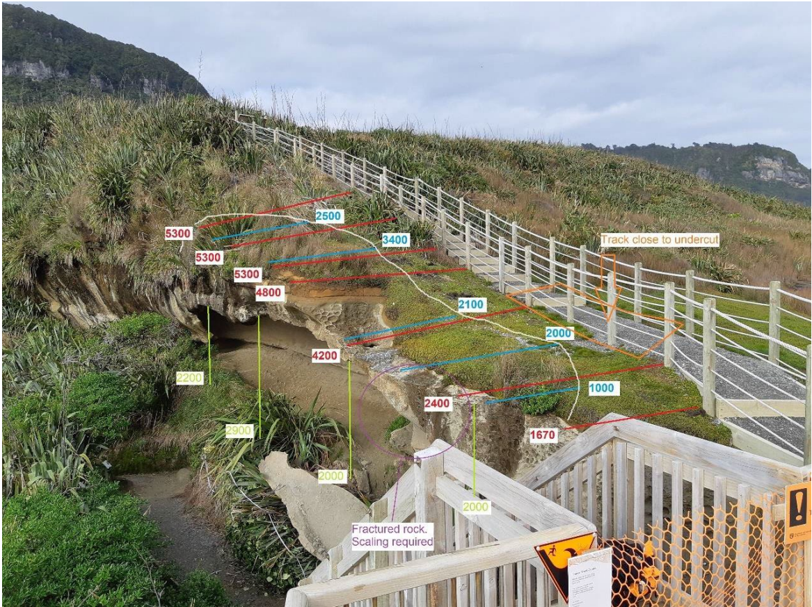
Caption: 3 -4-ton rockfall adjacent to the Truman Track after the July 2019 rockfall event.