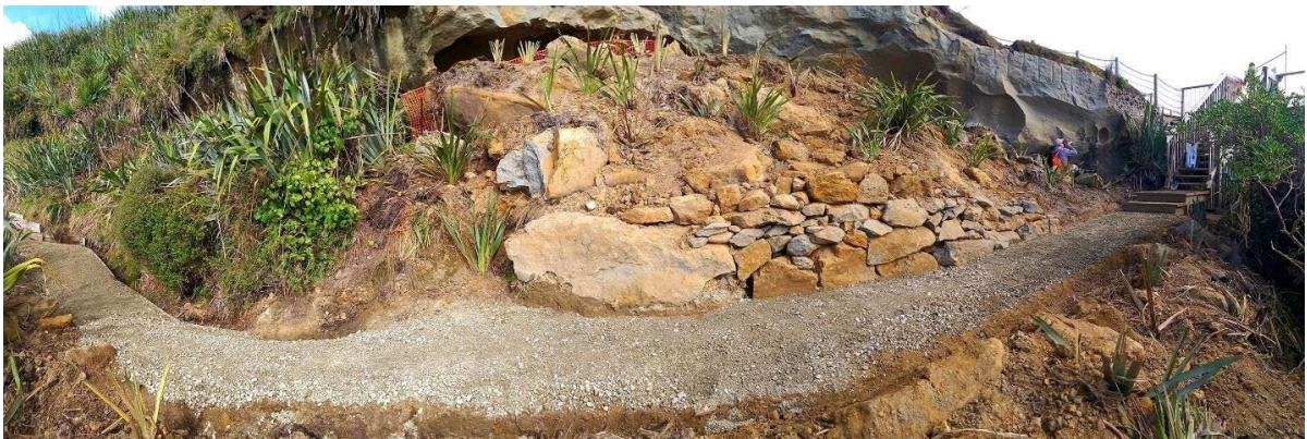
Completed work after a rock overhang adjacent to the Truman Track was removed.