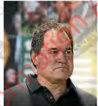
New Wallabies coach Dave Rennie.

"The new coach has a lot of experience so I think they should trust him to be able to run the show."