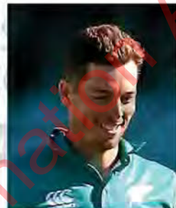
Mitchell Santner is scheduled to play the Caribbean and Indian Premier Leagues before returning home.