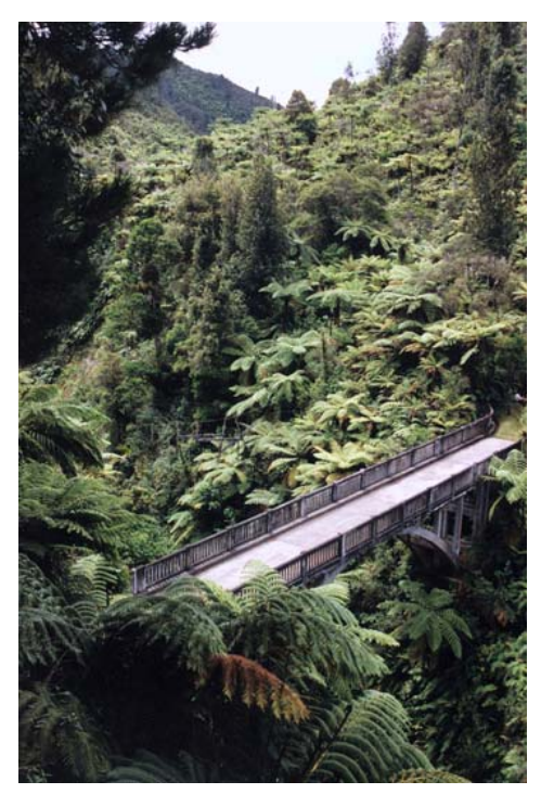
Bridge in 2001.

Concrete repairs in progress by Contech in February March 1996, total cost $70,000. The concrete was spalling in some locations areas due to insufficient cover of the reinforcing steel.