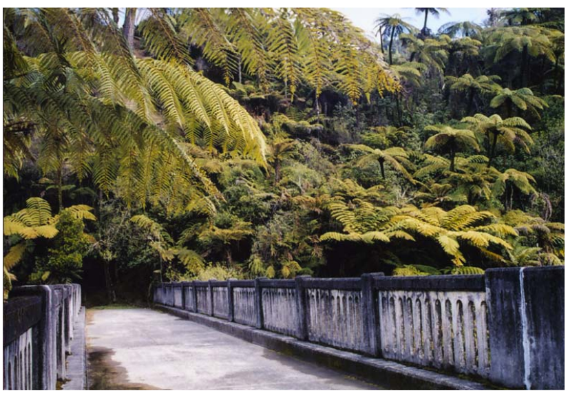
Bridge in 2003.