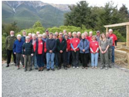
The Friends of Rotoiti at their October meeting.

The Friends have been busy over the winter converting old Fenn trap boxes to take DOC 200 traps. These new traps have been used to extend the Whisky Falls stoat line which now runs from the start of the Lakeside Track to Coldwater Hut. Some of the new traps will also be used to replace the remaining Fenn traps on the Mt Robert Road line.