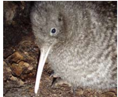
Marama, the fourth chick to be discovered.

kiwi are in good to excellent condition. Transmitters were changed on all but three birds that proved too difficult to catch before the onset of the breeding season. A kiwi dog will be necessary to find these birds again, once the battery life in their transmitters die.