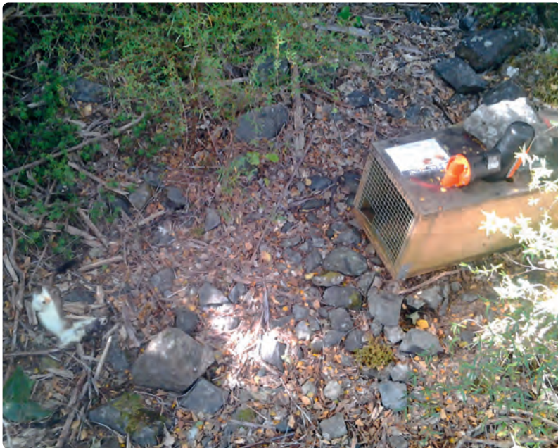
Often kills are found outside the trap box, such as this stoat found more than a metre away.

Over the first year of the trial, tracking card results showed no increase in mustelid abundance from previous years. The latest November results show a higher level of tracking than we would like for this time of year, so we will be keeping a close eye on stoat tracking results over the coming months. The trial will continue until winter 2014, after which Craig Gillies (the DOC scientist leading the project) will produce a formal report based on results from all trial sites.