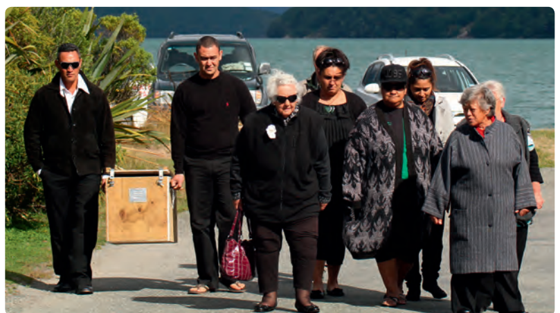
Ngāti Waewae escorting our new great spotted kiwi from the West Coast.

Two new kiwi were welcomed from the West Coast this year and this will help to improve the genetic diversity of our kiwi population.