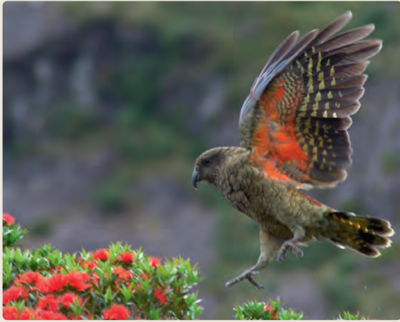
Nest monitoring is ongoing this summer for our local kea population.