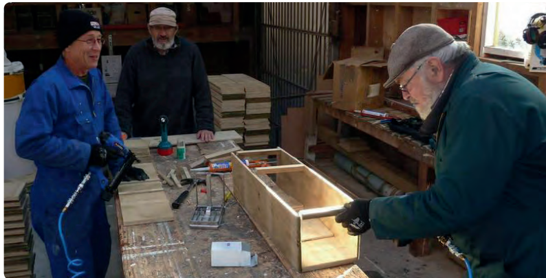
Nine months of planning, three days of box building, a couple of days setting out in the field — done!

The 77 run-through boxes were alternated with 77 baited traps, and have been set up along approximately 15.5 km of the Rainbow Valley stoat trapping line. The two-year research trial was designed by local DOC staff and members of the RNRP Technical Advisory Group scientists. The construction, field planning and trap checking will be done by FOR members.