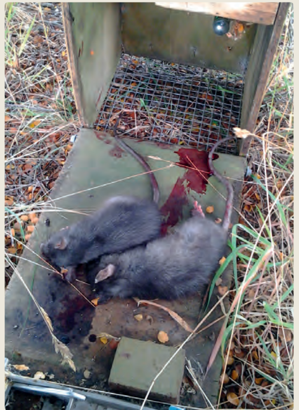
More than one kill is sometimes found in the box, with the record so far being three rats at once! This suggests that retro-fitting the A24s to trap boxes hasn't prevented their ability to kill multiple pests between checks.

This doesn't bode well for next season with rat numbers already so high and with the current heavy beech flowering indicating a probable beech mast (mass seeding event). When the beech seed falls next year this will increase rat numbers, which in turn, is expected to trigger a stoat plague the following summer. On the flip side the heavy beech mast will provide ample food for the local kākā population to breed.