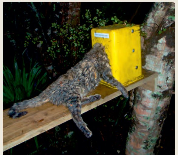
Young female feral cat caught in a Timms™ trap near the Bellbird Walk.

We've added another option to our feral cat control toolbox with twelve Timms™ traps set up using the 'raised set' method. These traps were set 1.2 m off the ground on a raised ramp, to avoid ground birds being caught. Three feral cats were caught in these Timms™ traps, with another nine caught in live capture cages. Feral cats are mostly targeted during the autumn when food abundance is low, they are hungry and young ones are learning to forage for themselves.