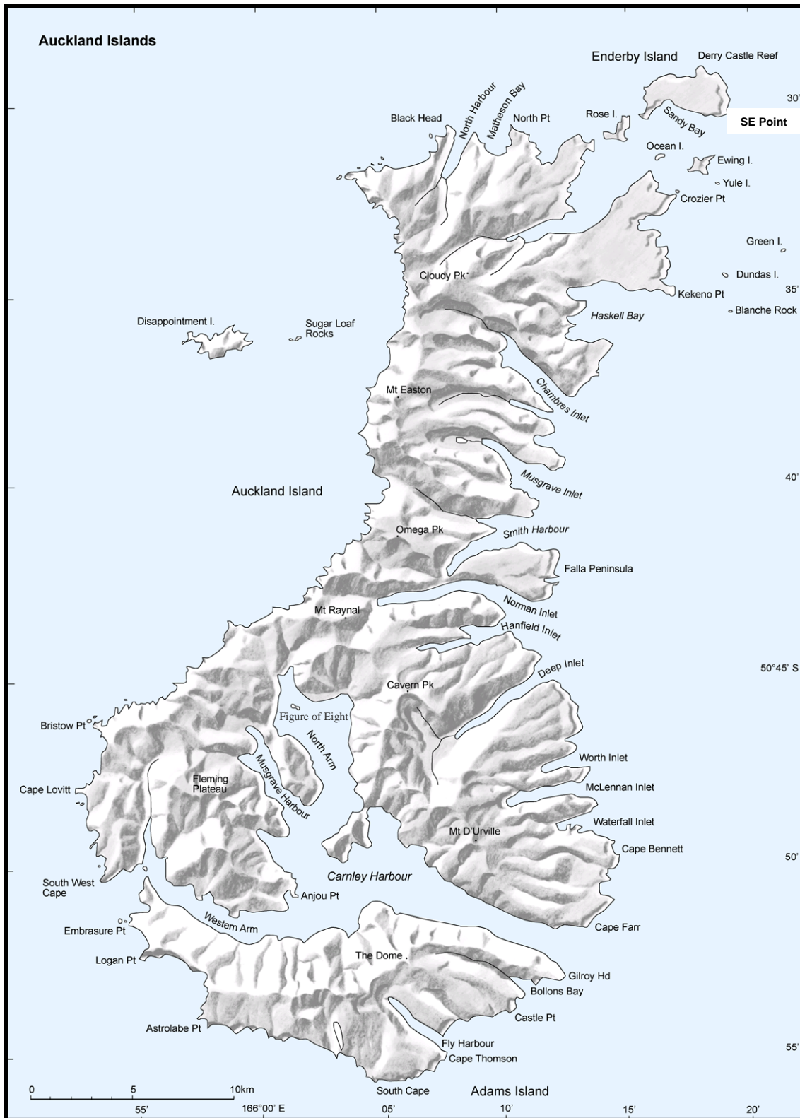
Figure 1: The Auckland Islands showing areas where sea lions were sighted: Figure of Eight, Dundas, Enderby and Auckland Islands.