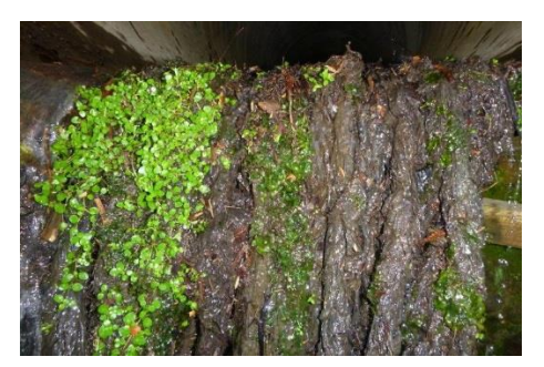
Figure 3. Photos from follow up visits to the perched culvert, showing that the ropes were still in excellent condition and remained taut with biological growth of mosses and filamentous algae covering (2015 and 2019. Photo: Bruno David).

Two follow up visits, in 2015 and in 2019, found the ropes to still be in excellent condition, remaining taut with biological growth of mosses and filamentous algae covering the ropes around the inlet and outlet areas where more light was available (Figure 3).