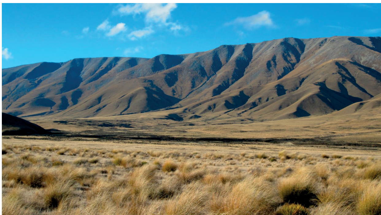
Upper Manuherikia River and Oteake Conservation Park.

The Conservation Act enables the Authority to establish committees to carry out functions or tasks delegated by the Authority.