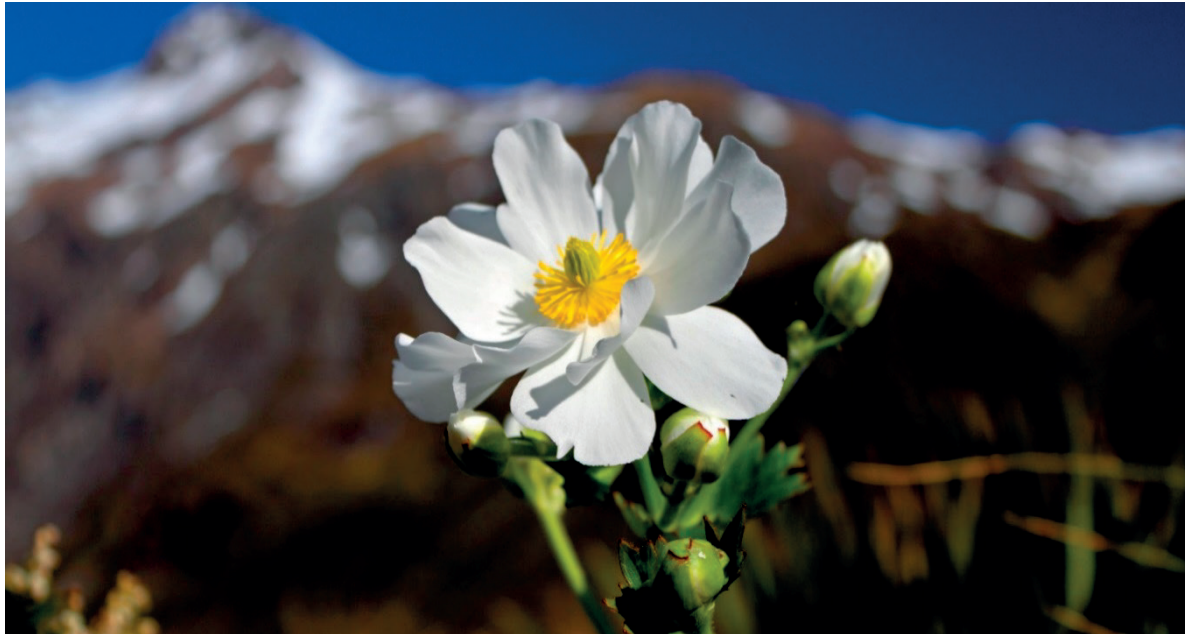
Giant buttercup Ranunculus lyalii .