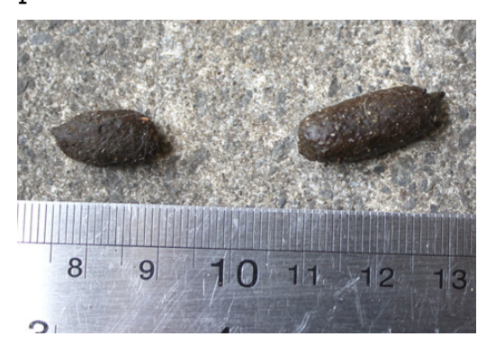
Possum droppings.

Possums were brought to New Zealand in 1837 by people who wanted to farm and hunt them for their fur. What people didn't realise was how many plants, birds and insects possums would eat without any large predators around to eat them.