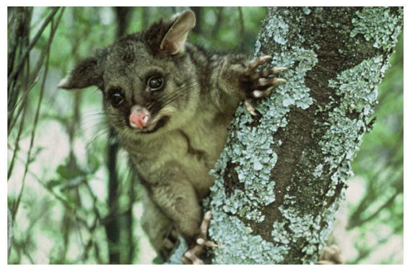
Possum in tree.

Possums eat mainly leaves (most often from our native trees). They will also eat the eggs and chicks of many native birds, such as kererū, kiwi and tūī, as well as native invertebrates like wētā and large land snails. Possums can do a lot of damage to New Zealand native animals and plants.