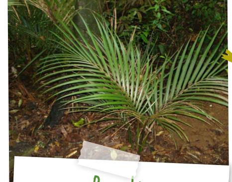
Bark Smooth, green ringed bark.