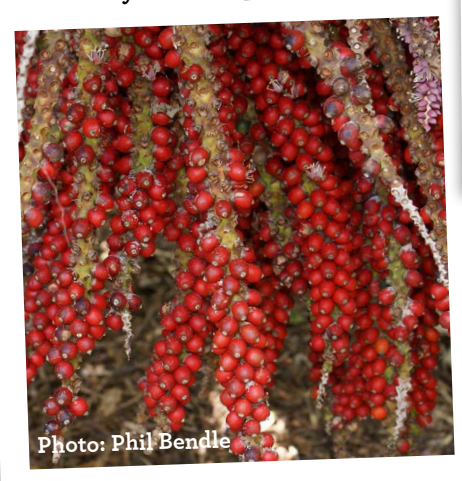
For more information about nīkau, see doc.govt.nz

in bunches and take about a year to ripen.