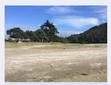
Waiwera sandy shore.

Mud flats are muddy environments with softer sediments. Animals that can dig into the mud, such as crabs, shellfish and birds, are suited to living here.