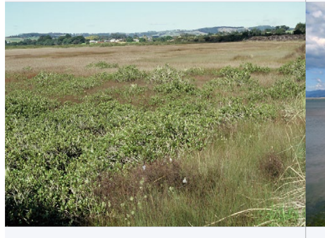
Mud flats/muddy shore