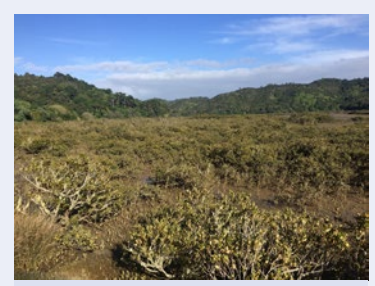
Orewa mangroves.

Saltmarshes occur in the upper intertidal zone and are home to plants that can tolerate water with a high salt content (eg rushes). Saltmarshes are usually found between mangroves or seagrass meadows and the land.