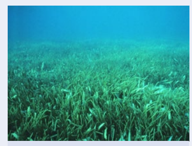
Seagrass meadow.