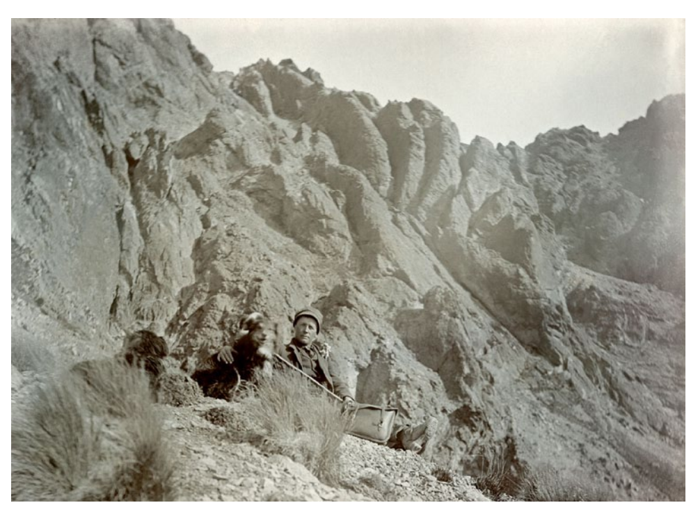
A shepherd rests with his nibbie, saddle bag and dogs on Black Hill in the Wairau Valley tops.