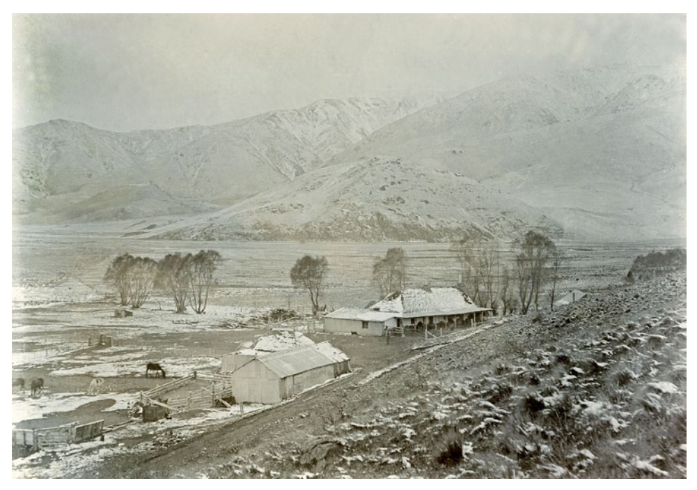
Tarndale Station homestead at Cat Creek. It also served as an accommodation house, being strategically placed between the Rainbow and the Acheron accommodation houses. This was the second Tarndale house, the first was sited at Horse Gully.

The station homesteads and purpose-built accommodation houses gave shelter and hospitality to travellers along the north–south tracks. The Provincial Government paid an annual allowance to all accommodation leaseholders to provide food, beds and stabling. Travellers were charged a small fee for the service.