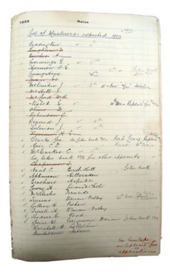
Farm book entries for 1922.

By 1916 Molesworth musterers were starting to make demands for better working conditions.