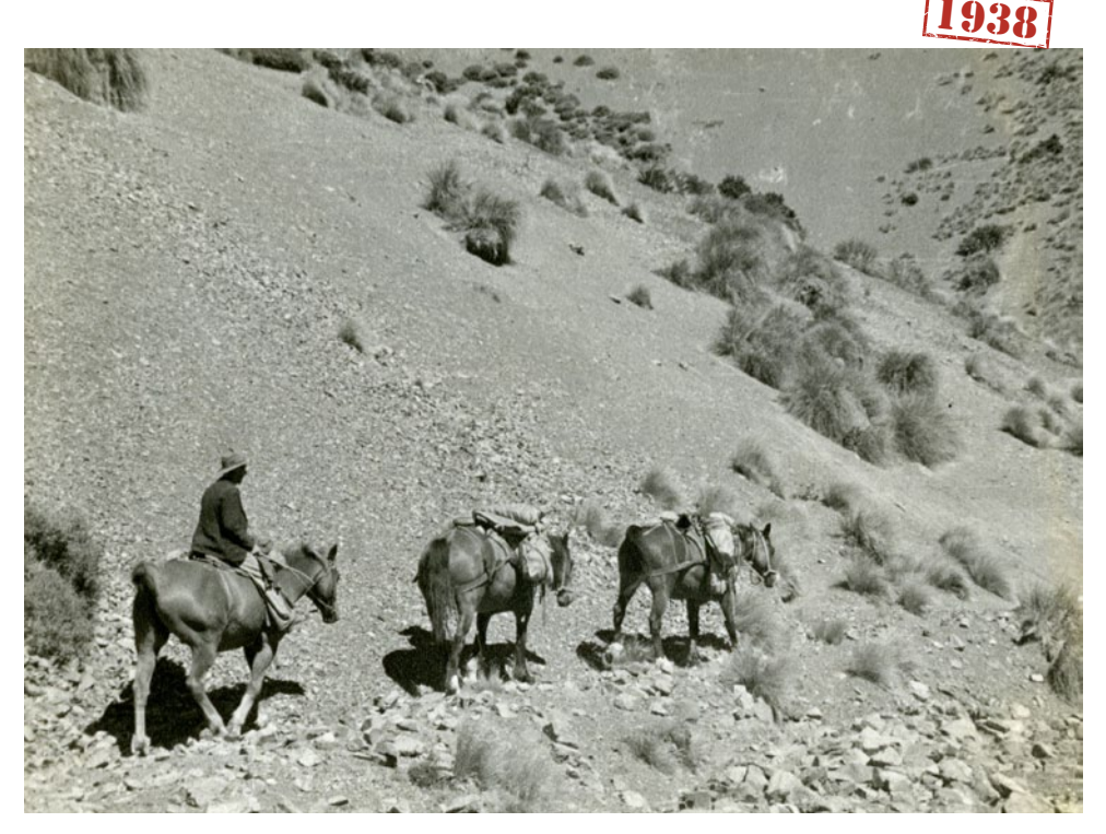
Pack-horse team on the Robinson Saddle (1400 metres). Travel over the higher saddles and passes required self-sufficiency to deal with the extremes of summer drought or winter snow.

The main horse tracks were commercially significant in the early days and were the primary overland routes between Nelson, Blenheim and Christchurch. The Nelson and Canterbury Provincial Governments established accommodation houses along these routes in the 1860s and these houses (and their successors) continued to function until the 1930s. The trip from Nelson to Christchurch on horseback took at least six days.