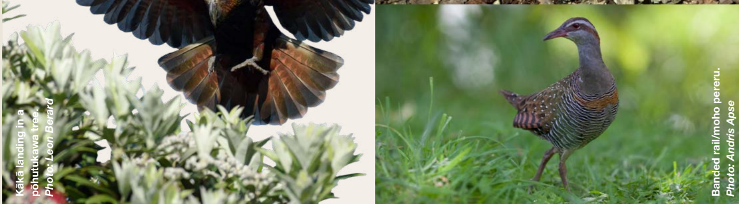
Kākā landing in a pohutukava tree.