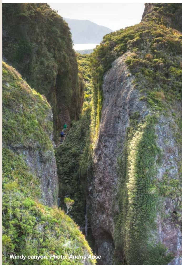
Windy canyon.

Starting from Whangaparapara Road, the Kaitoke Springs Track begins flat and easy, following an ancient shoreline. Follow the boardwalks across the unique Kaitoke Wetlands and listen out for the call of a fernbird or spotless crane, or maybe spot the orchids and sundews close to the track. Enjoy the hot pools but take care - they may be too hot in places. After a brief, steep climb and descent, join Tramlane Track North, which harbours reminders of the toil of loggers and journeys 80 years ago. Peach Tree Track soon appears on the left and you climb steadily through the regenerating forest to reach Mt Heale Hut. On a clear evening the striking sunsets over Te Hauturu-o-Toi/Little Barrier Island make the journey all worthwhile.