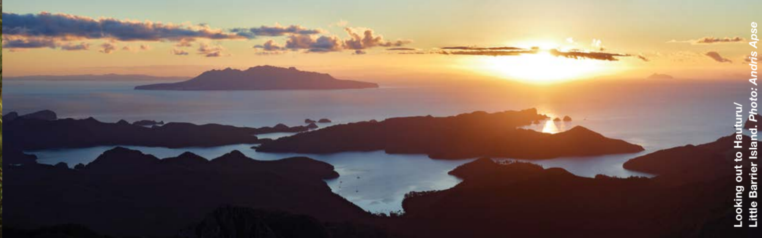
Looking out to Hauturu/Little Barrier Island.