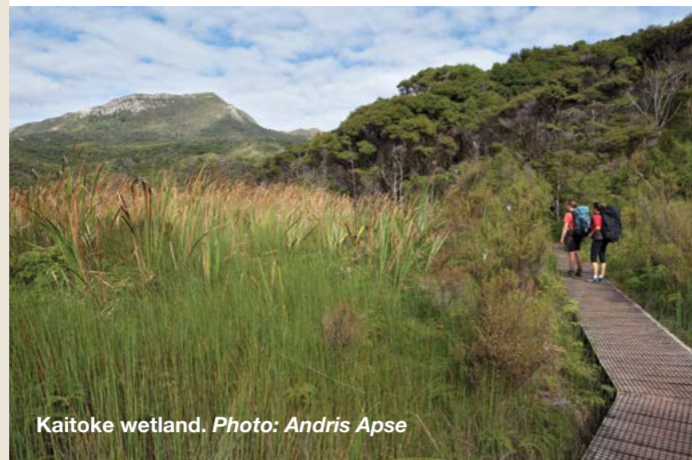
Kaitoke wetland.