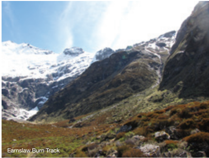
Earnslaw Burn Track

tussock basin beneath Mt Earnslaw/Pikirakatahi, with stunning views up the Rees Valley towards Rees Saddle. The zigzag track starts on the low terrace north of Lennox Falls, where the bush edge meets the terrace. One hour up, Earnslaw Hut (basic) has 4 bunks; 15 minutes further on there is a rock bivvy just above the bushline. Kea Basin adjoins the Mt Earnslaw/Pikirakatahi Tōpuni, which recognises the historic and cultural importance of this mountain to Kāi Tahu.