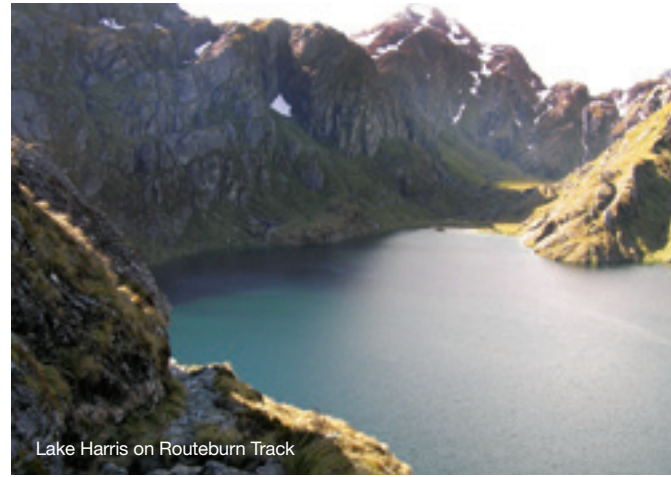
Lake Harris on Routeburn Track

From Lake Sylvan (#9) the marked track traverses moraine through beech forest. After severe storm damage the Rockburn Hut had to be removed, but a nearby camp shelter, owned by Dart River Jet Safaris, is available for public use. River beaches and pools and a chasm are close by. Climb through forest to the fragile Sugarloaf Saddle with great views of the Rockburn and Routeburn valleys. The descent to the Routeburn Track is steep.