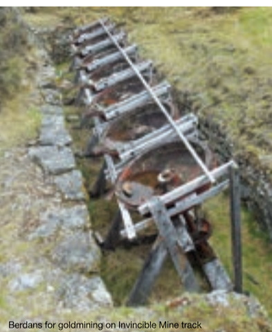
Berdans for goldmining on Invincible Mine track

GENERAL INFORMATION Always contact the nearest DOC Visitor Centre for the latest information on facilities and conditions, and ensure you are prepared for the weather conditions. Higher altitude tracks can be exposed and icy from autumn through winter, and well into spring. Remember—your safety is your responsibility. Choose a track that suits your level of fitness and experience. Follow the Outdoor Safety Code: • Plan your trip • Tell someone • Be aware of the weather • Know your limits • Take sufficient supplies www.adventuresmart.org.nz Maps are guides only The map in the brochure should not be used for navigational purposes. We strongly recommend purchasing topographical maps from the DOC Visitor Centre: NZ Topo50 CA10, CBo9, CB10. Please respect private land Respect the landowner's property where tracks cross private land. Stay on the track, don't disturb livestock and leave gates as you find them. Thank you.