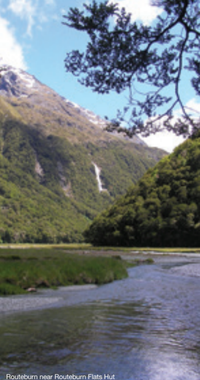
Routeburn near Routeburn Flats Hut

GENERAL INFORMATION Always contact the nearest DOC Visitor Centre for the latest information on facilities and conditions, and ensure you are prepared for the weather conditions. Higher altitude tracks can be exposed and icy from autumn through winter, and well into spring. Remember—your safety is your responsibility. Choose a track that suits your level of fitness and experience. Follow the Outdoor Safety Code: • Plan your trip • Tell someone • Be aware of the weather • Know your limits • Take sufficient supplies www.adventuresmart.org.nz Maps are guides only The map in the brochure should not be used for navigational purposes. We strongly recommend purchasing topographical maps from the DOC Visitor Centre: NZ Topo50 CA10, CBo9, CB10. Please respect private land Respect the landowner's property where tracks cross private land. Stay on the track, don't disturb livestock and leave gates as you find them. Thank you.