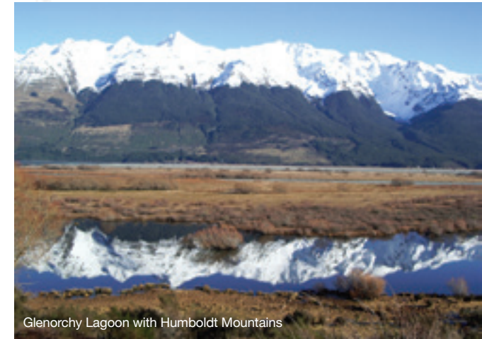
Glenorchy Lagoon with Humboldt Mountains

Glenorchy, at the head of Lake Wakatipu, is 48 kilometres from Queenstown. In the mountain valleys beyond the township are some of New Zealand's best-known multi-day tracks. There are also great day walks on these tracks and many shorter walks.