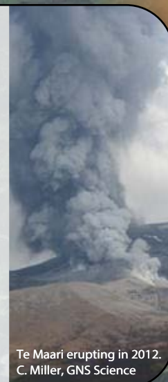
Te Maari erupting in 2012.