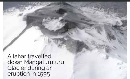
A lahar travelled down Mangaturuturu Glacier during an eruption in 1995

Version 7.0 2020 gns.cri.nz/volcano-hazard-maps