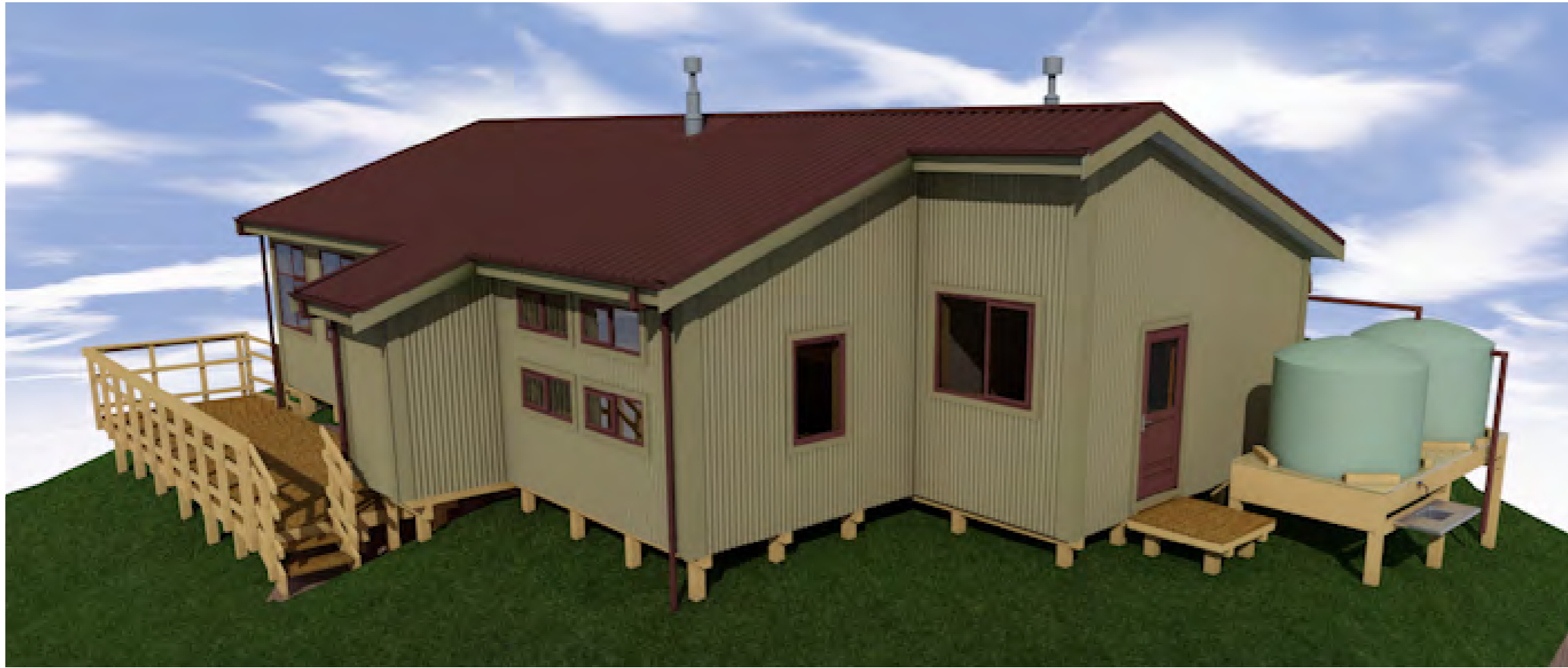
1602 Moonlight Tops Hut 3D View 3

J:\Clients CAD\1602 Pike huts\1602 Drawing Documents\Moonlight Tops Hut\1602 Pike River Huts Moonlight Tops.pln