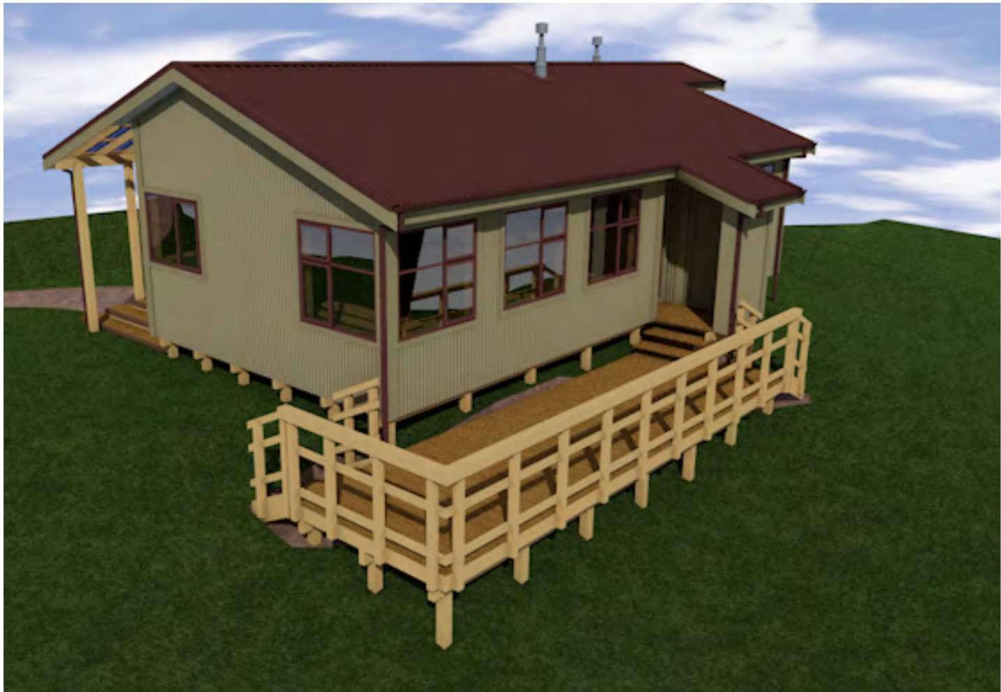
1602 Moonlight Tops Hut 3D View 2

J:\Clients CAD\1602 Pike huts\1602 Drawing Documents\Moonlight Tops Hut\1602 Pike River Huts Moonlight Tops.pln