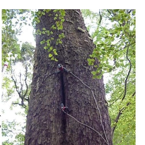
Figure 1. Single through-beam, active infrared beam counter system positioned directly outside a lesser shorttailed bat roost hole in a red beech tree.