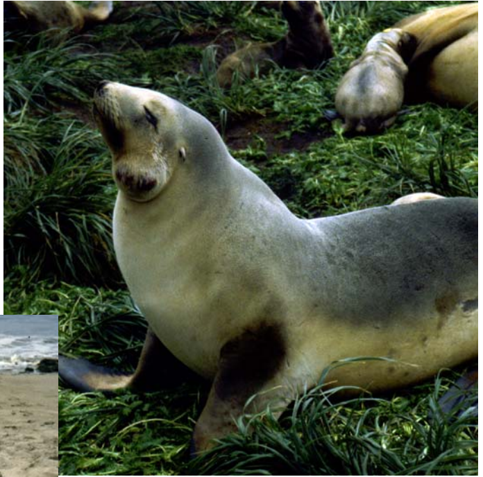
Adult female sea lion with advanced throat swelling.