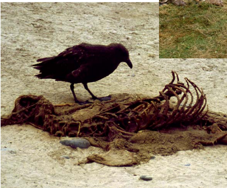
An ill wind: a sea lion carcass is scavenged by a brown skua.