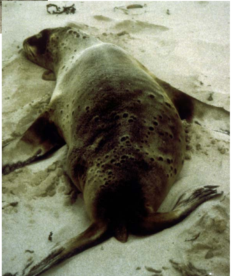
Dead adult female sea lion with dorsal and lumbar lesions.