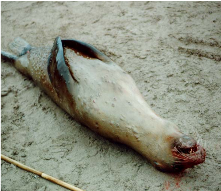
Dead adult female sea lion with extensive ventral lesions.