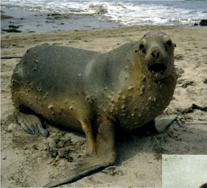
Adult female sea lion with thoracic and abdominal lesions.