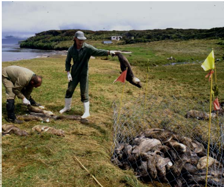
Dead sea lion pups were accumulated in several localities during the mortality event to prevent multiple counting and the spread of disease.